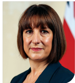
Official portrait of Rachel Reeves MP

Other significant tax increases included higher capital gains tax rates and a future reduction in inheritance tax business and agricultural reliefs. Despite the additional revenue, the Office for Budget Responsibility (OBR) projects that increased spending will mean that borrowing will still be over £70 billion in 2029/30. Not without reason does the OBR say, “...this Budget delivers a large, sustained increase in spending, taxation, and borrowing”.